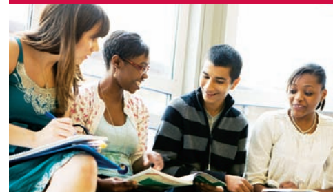
YOUTH WORKFORCE CENTER