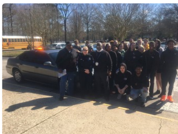
New Police Cruiser

Great Clips lending a hand to our Cosmetology 2 students