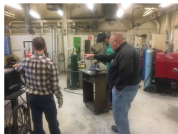
Skills USA District Competition

Thanks to the City of Hampton for donating this police cruiser to the Criminal Justice program