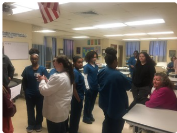
CNA Open House Session