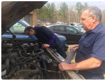
Auto Tech 2