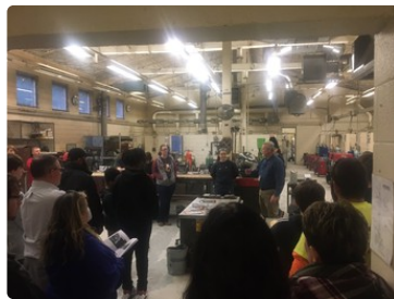
Welding Open House Session