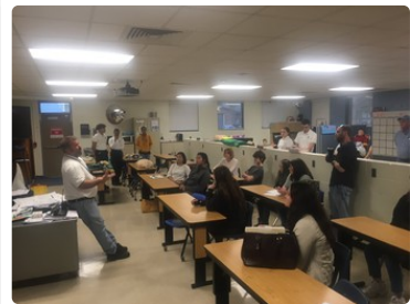
EMT Open House Session